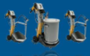
OptiSelect® Pro Type GM04 OptiStar® Type CG21 OptiFlex® Pro Manual coating equipment