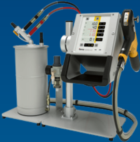
OptiFlex® Pro L