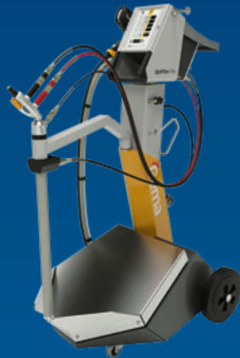
OptiFlex® Pro Q