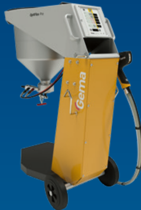
OptiFlex® Pro S