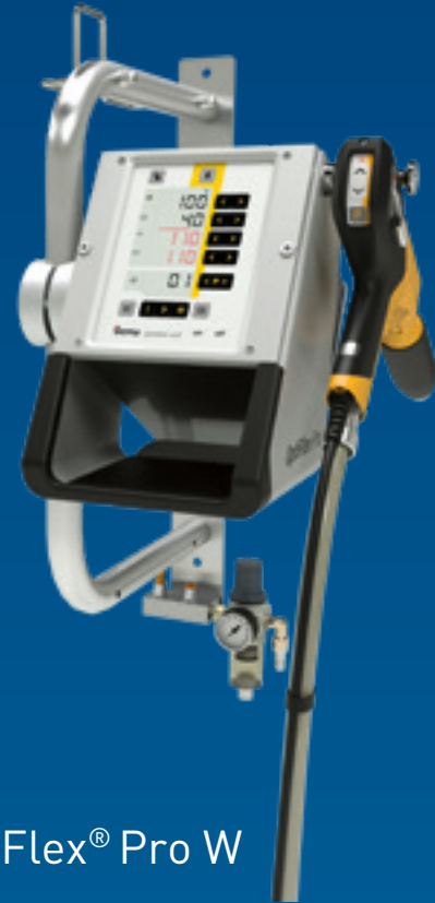
OptiFlex® Pro W