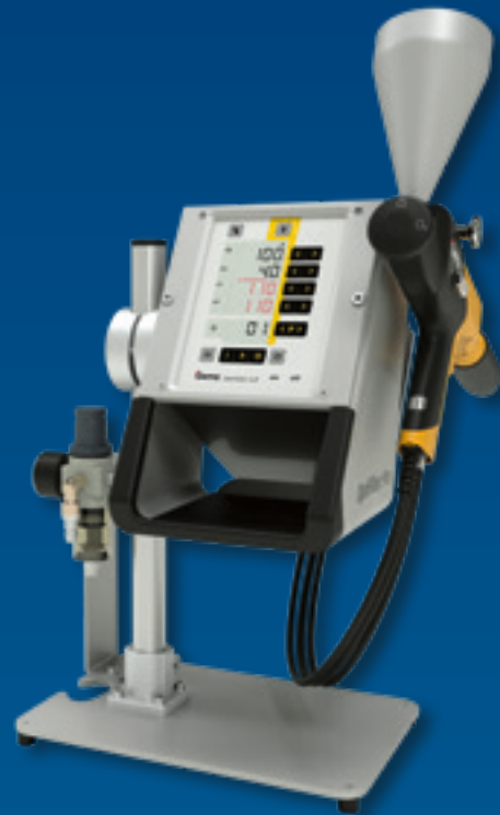
OptiFlex® Pro CF