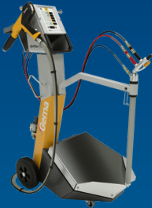
OptiFlex® Pro B