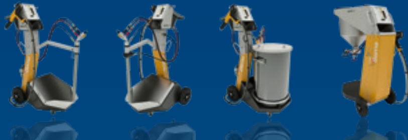
OptiFlex® Pro B OptiFlex® Pro Q OptiFlex® Pro F OptiFlex® Pro S