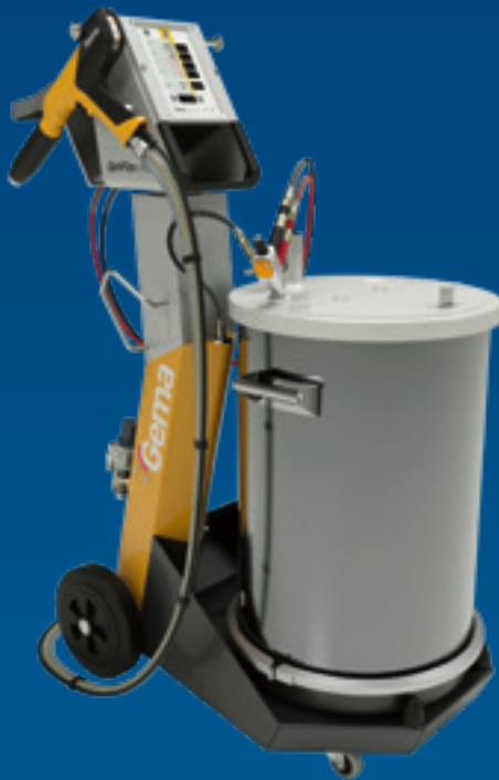
OptiFlex® Pro F