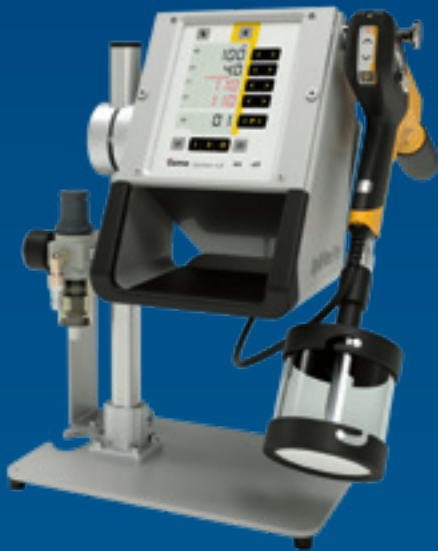
OptiFlex® Pro C